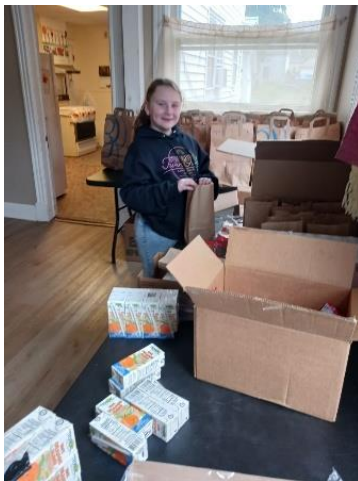
Packing up for the Annual Backpack Give-a-way

Our Administrative Assistant brought her granddaughter who filled the backpacks and all the give-a-way bags to be ready for the Day. This is our 5th Annual Backpack give-a-way and the funds for the backpacks come from a grant from Stewarts. The rest of the supplies are from the generous donations of our congregation.